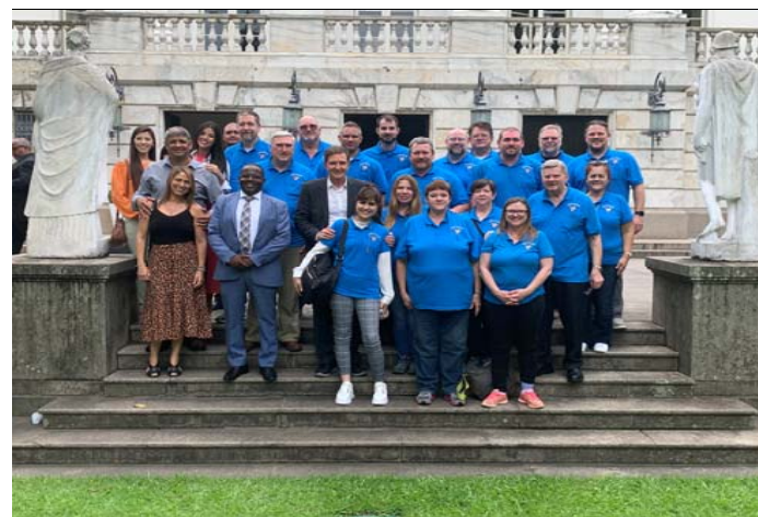
Brazil mission team pictured with the mayor of Rio de Janeiro, Brazil.