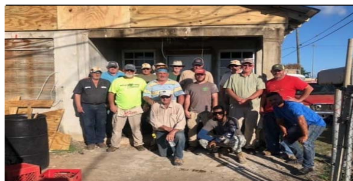
Puerto Rico team with several GBA volunteers.