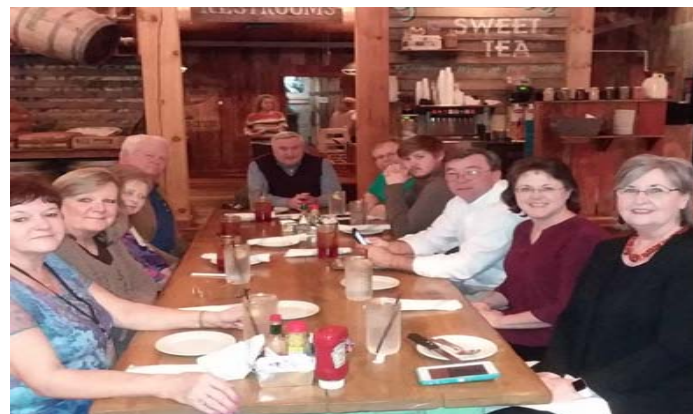
Bivocational Pastors & Wives Retreat. GBA pastors and wives enjoying a meal together.

2020 Disaster Relief Regional Training West Tennessee - Newbern First Baptist - April 17 & 18 More information can be found at tndisasterrelief.org .