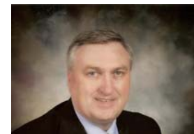
A Missionary View

Celebrating 31 years of assisting GBA members to go on Mission for the Lord!