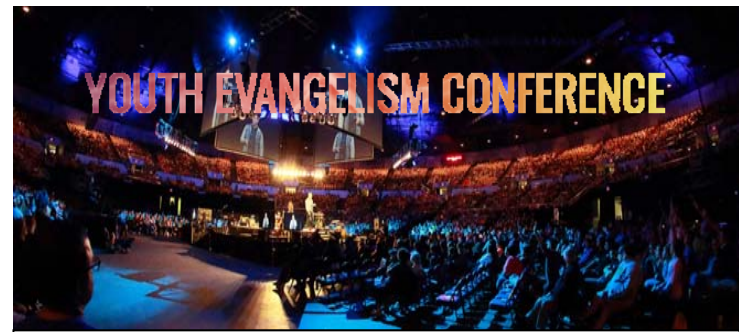
The Youth Evangelism Conference will be March 13-14, 2020 at the Nashville Municipal Auditorium. Check the TBMB website for more information.