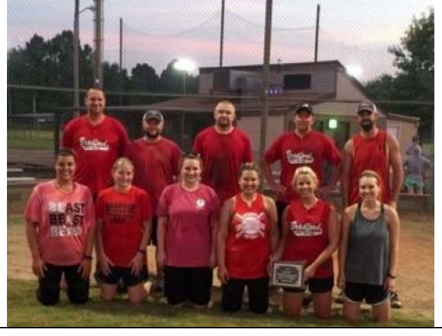
Congratulations to Beech Grove for placing 1st place in the Co-Ed softball tournament. They were undefeated this season and also placed 1st last year. Congratulations to Bradford FBC for placing 2nd in the Co-Ed Tournament.