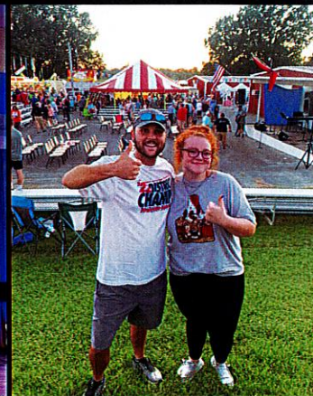
Pictured Above Left: The West Tennessee Evangelism Rally