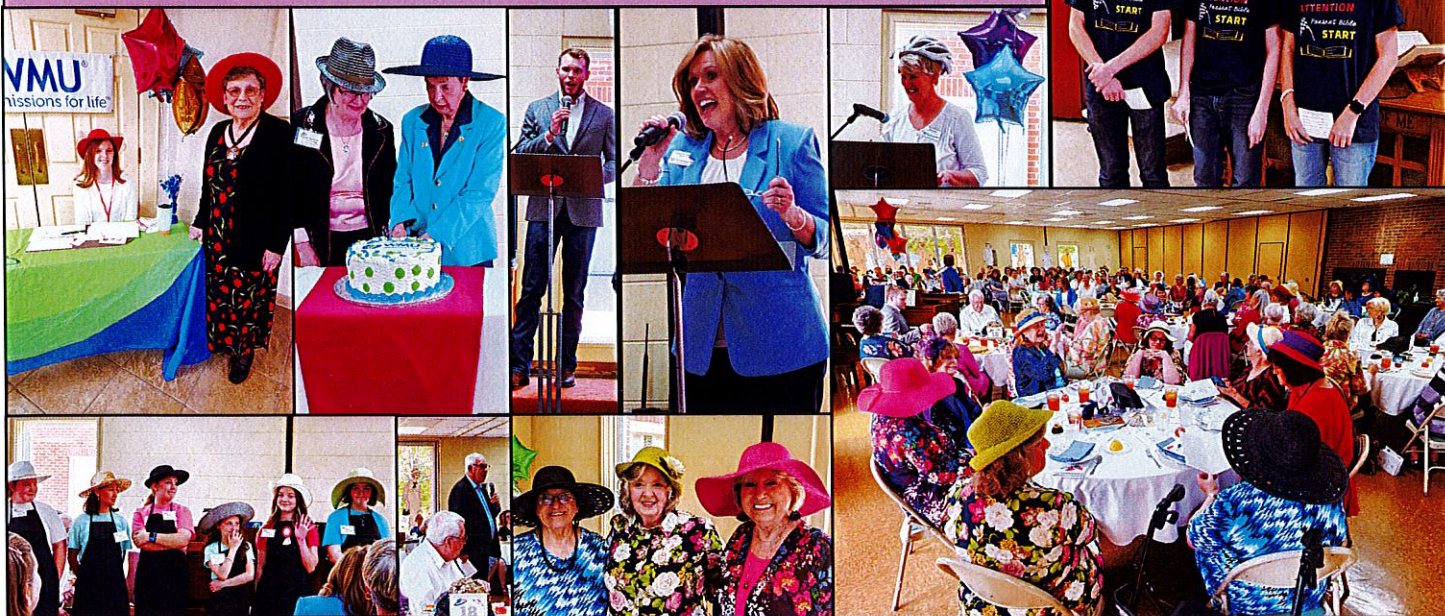
Pictured Above: WMU 100th Anniversary Luncheon Celebration - Thank you Sugar Creek and GBA WMU for a wonderful day!