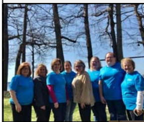
Pictured Left: FBC Kenton hosted a Virtual WMU get-together.