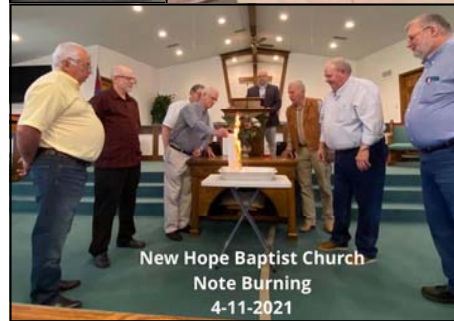
Pictured Right: Swing into Spring Senior Adult Event hosted by Dyer, FBC. Oak Grove & Salem won trophies for attendance. Pictured Left: New Hope Baptist Church Note Burning 4-11-2021. New Hope paid off their family life center.