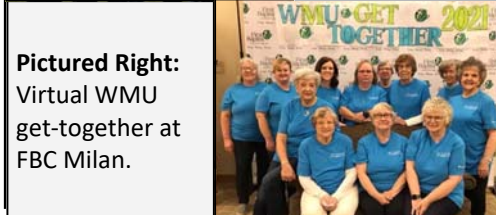
Pictured Right: Virtual WMU get-together at FBC Milan.