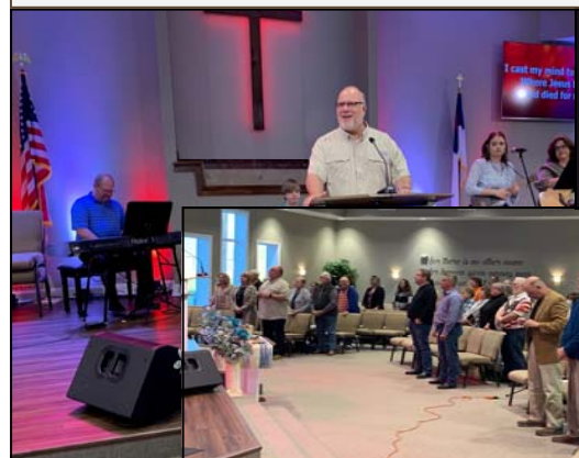
Pictured Left: Salem Baptist hosted GBA's Seven Sayings from the Cross on Good Friday. Pictured Right: Maranatha Hispanic Church Block Party