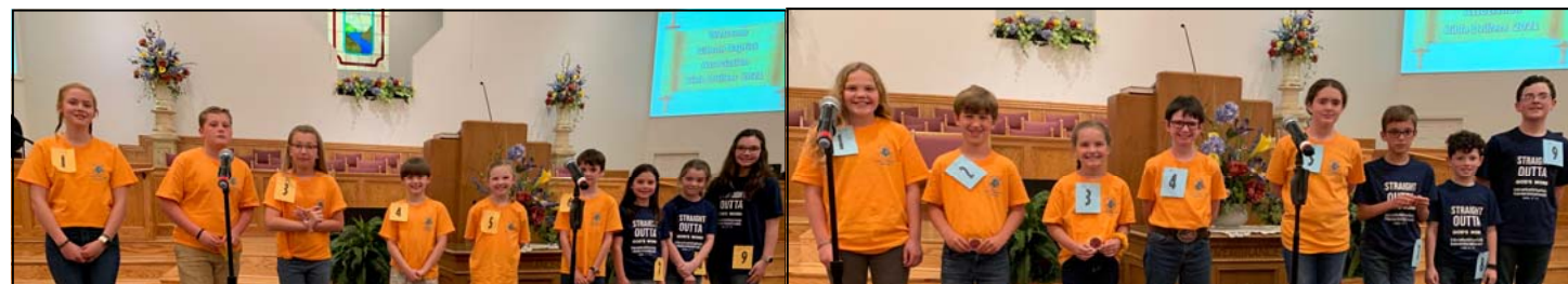
White Hall hosted the GBA Bible Drills. Seventeen children participated and sixteen will move on to the regionals.

Providing Christ-centered homes where children can thrive is difficult and expensive. Giving is the easy part. TBCH receives no government money, they are totally donor-supported. Please consider giving a gift today.