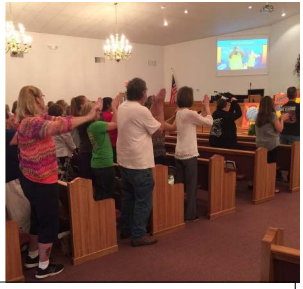
The GBA VBS Clinic was held at White Hall Baptist Church on April 28th. We appreciate those that came from across the state to train our leaders.