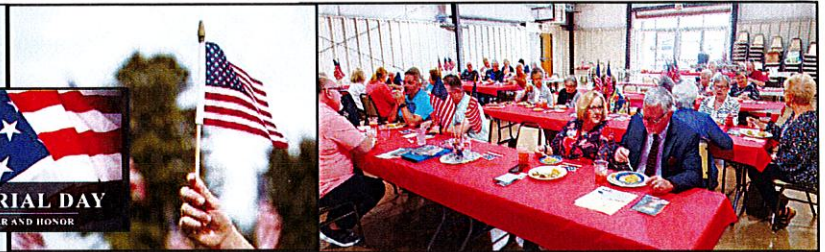
Pictured Below: Left - Twice Blessed Community Day / Right - Pastors Conference Pictured Above: National Day of Prayer