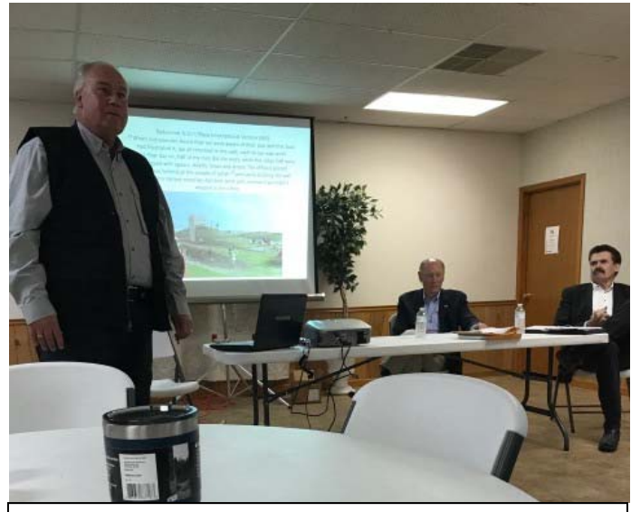
Salem Baptist Church hosted the GBA Security Training for area churches. There were 8 churches from GBA in attendance and 2 churches from Jackson.

THE VISION - 109-950 Published monthly by GBA, mailed second class at PO Box 186, Trenton TN 38382 GBA OFFICE PHONES: Office: 731-855-1202 FAX: 731-855-9846 WEB SITE: www.gbalife.org E-Mail: rdstacy@gbalife.org dklutts@gbalife.org