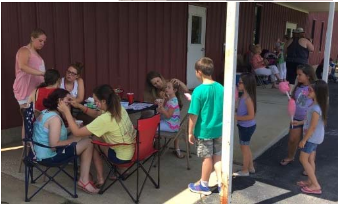
Fruitland Baptist Church held a Block Party for their community on June 10. Over 50 people attended. They were able to do this with the help of M&M, a GBA WMU mission endeavor. GBA WMU wants to thank the eleven churches that helped with this project: Antioch, Bethel-Y, Center, Connect, Dyer, FBC, Emmanuel, Maranatha, Oak Grove, Salem, The Church at Sugar Creek, and White Hall, Three unchurched families indicated a desire to attend Fruitland.