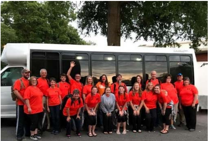
Dyer, FBC went to Quito Ecuador with a team of 21 members June 3-10. They saw over 1,150 patients and had more than 350 professions of faith. They appreciated so much the financial assistance their team received from the Wingo Fund. And they look forward to being able to assist others with their annual Wingo Offering !