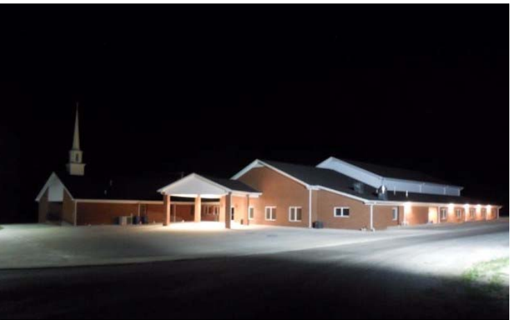
New Hope Baptist Church held their dedication service for their new building on May 21st. The building is their family life center. It is a multi purpose building that will hold their Sunday School classrooms, offices and gym., etc.