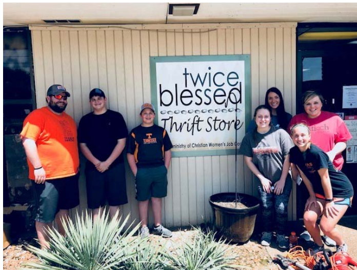
Antioch Baptist Church Youth did a service day at Twice Blessed. Their ministry was greatly appreciated. They trimmed the bushes and also straightened up the store itself.

If your youth group would like to have a ministry day, please contact Christy Skelton. They can always use the help especially with Twice Blessed moving their office/store soon.