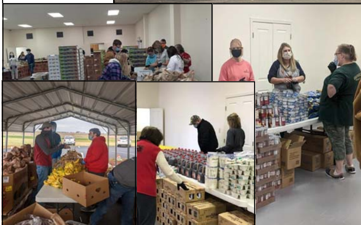
Pictured Above: Food drive at Laneview Baptist Church in Kenton on December 12.