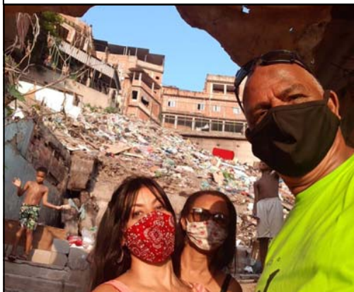
Rio Kids Update Thank you for helping feed 150 kids in Rio! Your donations are needed and very much appreciated. If you would like to help please send checks to the GBA office marked for "Rio Kids".