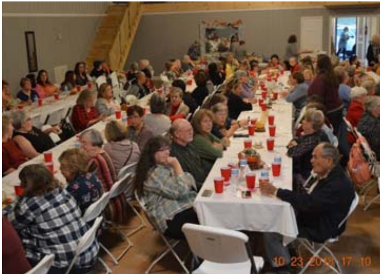
The Christian Women's Job Corp's (Twice Blessed) Night of Hope was very well attended. It was held on October 23rd.

THE VISION - 109-950 Published monthly by GBA, mailed second class at PO Box 186, Trenton TN 38382 GBA OFFICE PHONES: Office: 731-855-1202 FAX: 731-855-9846 WEB SITE: www.gbalife.org E-Mail: rdstacy@gbalife.org dklutts@gbalife.org