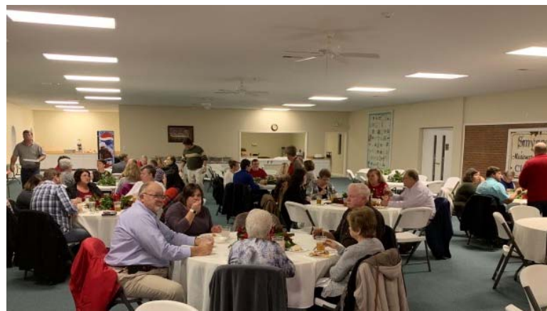
Smyrna Baptist Church hosted the GBA Pastors and Wives Christmas Dinner on Dec 6th. The annual event was well attended.