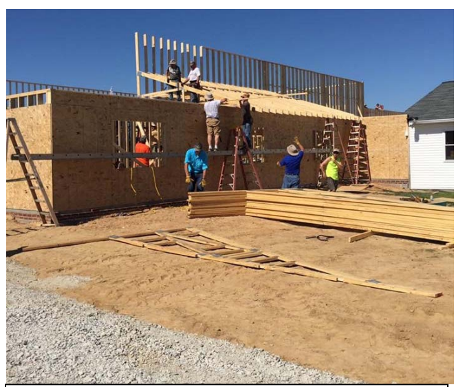
This is the construction scene at New Hope Baptist Church, Dyer . Several Christian based volunteers have come in to help from other states.