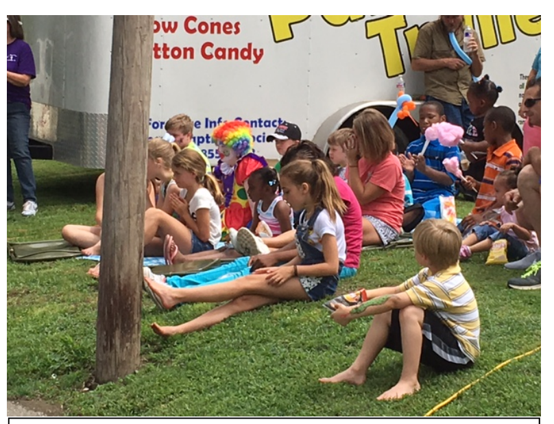
WMU, through their M&M projects, helped Maranatha Baptist Church with their block party event on May 28th. It was an huge success for their church.