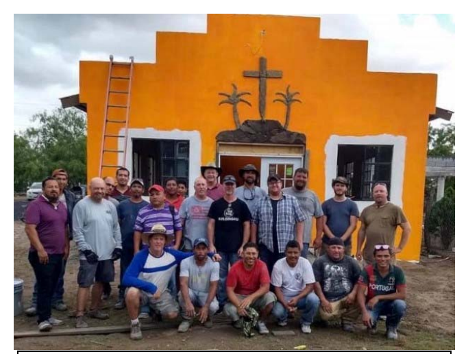
Chapel Hill mission team built a chapel in Matamoros Mexico the week of June 4th.

THE VISION - 109-950 Published monthly by GBA, mailed second class at PO Box 186, Trenton TN 38382 GBA OFFICE PHONES: Office: 731-855-1202 FAX: 731-855-9846 WEB SITE: www.gbalife.org E-Mail: rdstacy@gbalife.org dklutts@gbalife.org