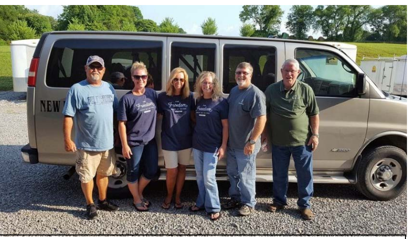
New Bethlehem bricked part of the Missionary Residence in Mt. Juliet and built columns and placed stone on the M at the Disaster Relief Missions Mobilization Center