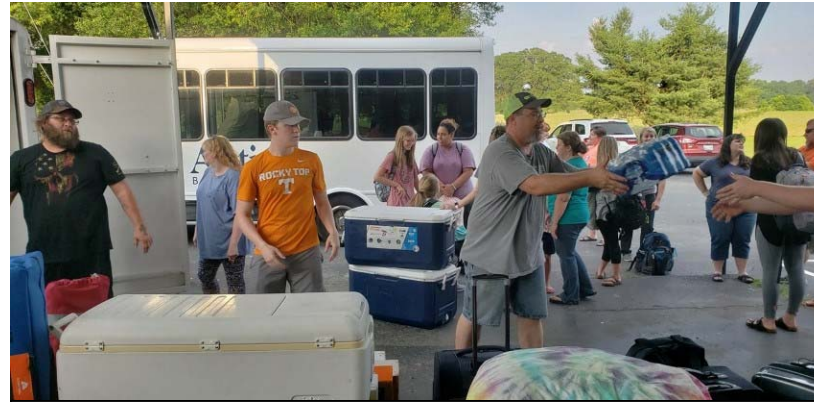
Antioch Baptist Church took a mission team to the Appalachia the week of June 9th.