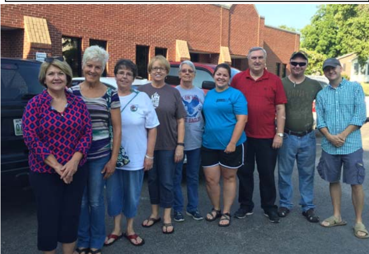
A team of volunteers from 5 GBA churches, Center, Rutherford, FBC, White Hall, Bradford, FBC and Humboldt FBC , went to Maryville, OH on a mission trip.