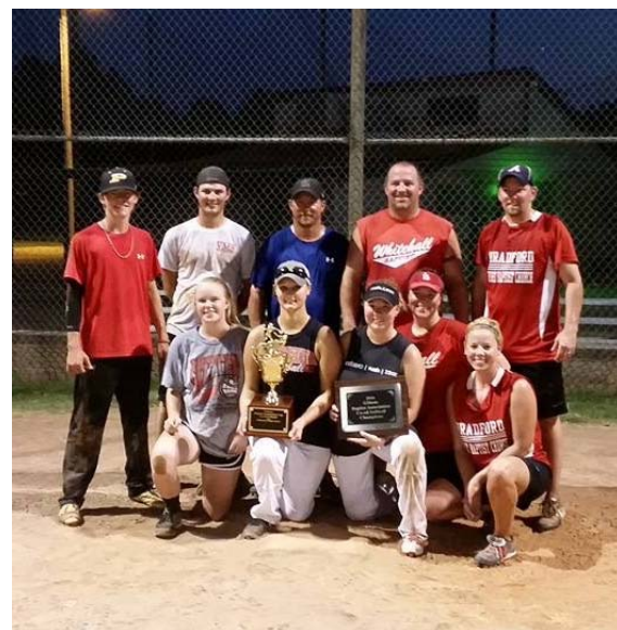
White Hall/Beech Grove Co-Ed team won for the GBA tournament.