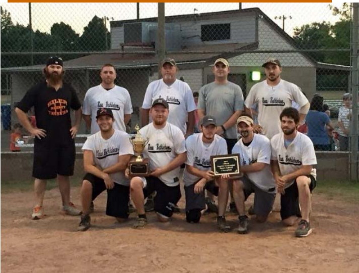
New Bethlehem Baptist Church won the Men's Softball.

ATTENTION CHURCH CLERKS Annual Church Profiles are in the office ..please send someone to come up your church's. DUE OCT 3!