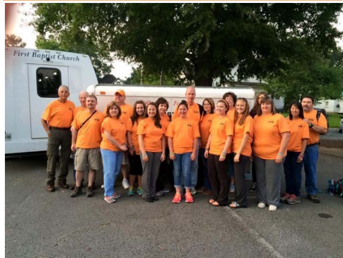
First Baptist Church, Dyer sent a mission time to Ecuador in July.