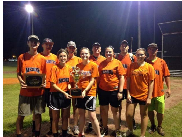
Medina, First Baptist Church won the Co-ed Softball League.