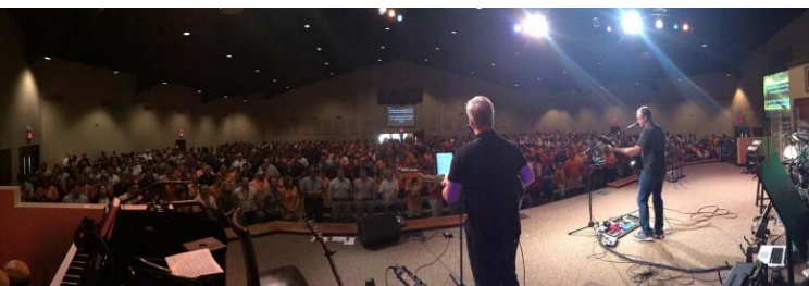
Chapel Hill Baptist Church held their annual men's conference on August 15th. There were over 900 men in attendance.