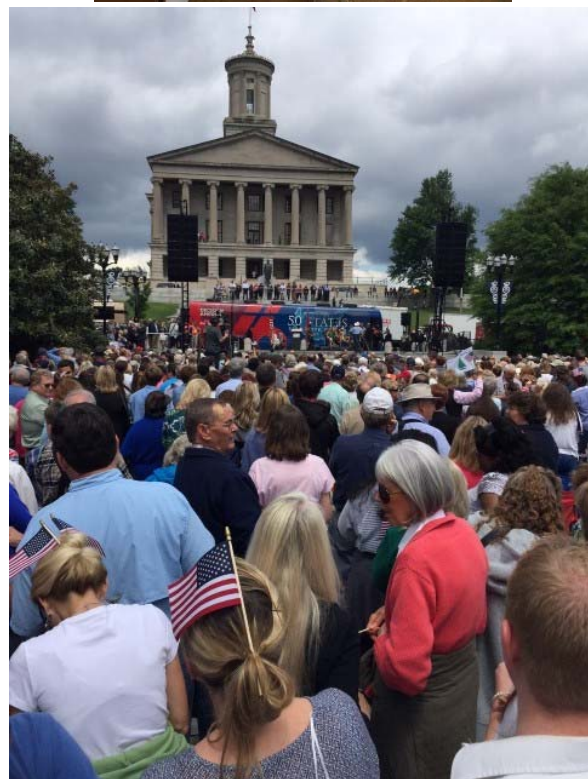
Over 8,600 people went to the prayer rally at the TN Capital for the Franklin Graham Decision America on May 3rd.