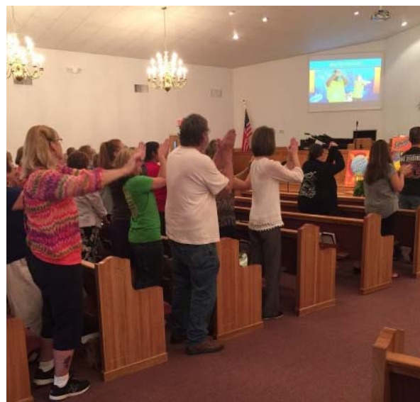
The GBA VBS Clinic was held at White Hall Baptist Church on April 28th. We appreciate those that came from across the state to train our leaders.