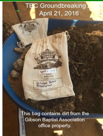
This bag contains dirt from the Gibson Baptist Association office property.

THE VISION - 109-950 Published monthly by GBA, mailed second class at PO Box 186, Trenton TN 38382 GBA OFFICE PHONES: Office: 731-855-1202 FAX: 731-855-9846 WEB SITE: www.gbalife.org E-Mail: rdstacy@gbalife.org dklutts@gbalife.org