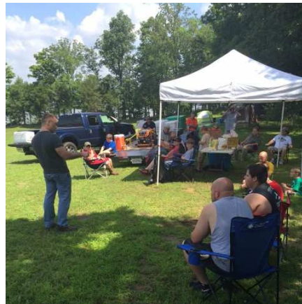
The annual GBA boys camp was held on June 5-6 despite bad weather on the evening of the 4th.