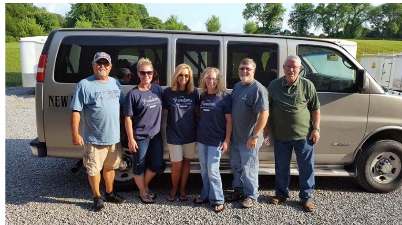
New Bethlehem bricked part of the Missionary Residence in Mt. Juliet and built columns and placed stone on the M at the Disaster Relief Missions Mobilization Center

THE VISION - 109-950 Published monthly by GBA, mailed second class at PO Box 186, Trenton TN 38382 GBA OFFICE PHONES: Office: 731-855-1202 FAX: 731-855-9846 WEB SITE: www.gbalife.org E-Mail: rdstacy@gbalife.org dklutts@gbalife.org