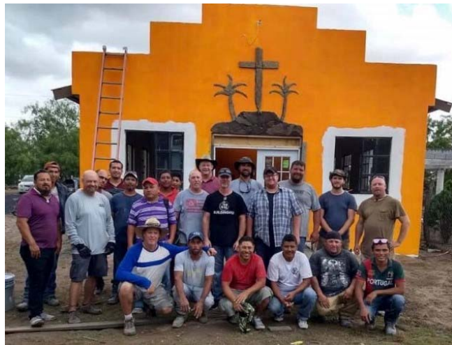
Chapel Hill mission team built a chapel in Matamoros Mexico the week of June 4th.