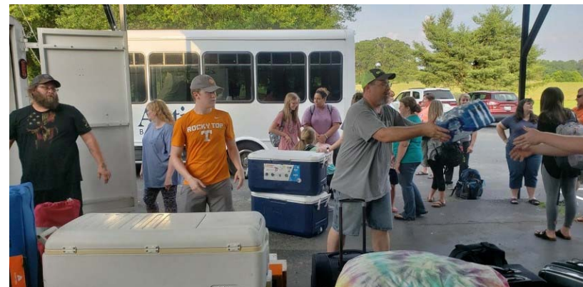
Antioch Baptist Church took a mission team to the Appalachia the week of June 9th.